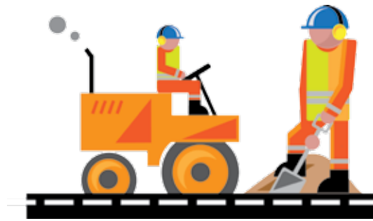
Disadvantaged regions in EU member states can receive EU funding for expanding their road network.

The EU's revenues are mainly composed of member states' contributions, also known as "own resources", which consist of revenues from customs duties and