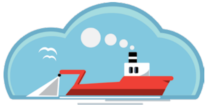
Some of the EU's expenses go to the fisheries sector.

Greece, Poland and Portugal are the greatest net recipients. This means that they get back more in the form of support and grants than what they pay in contribu-